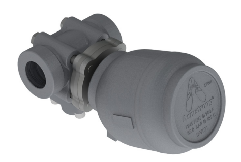
FF-4700 with IS-4 Connector