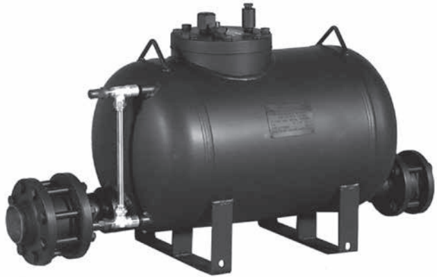
Table CRE-236-1. EPT-300 Pumping Trap Physical Data