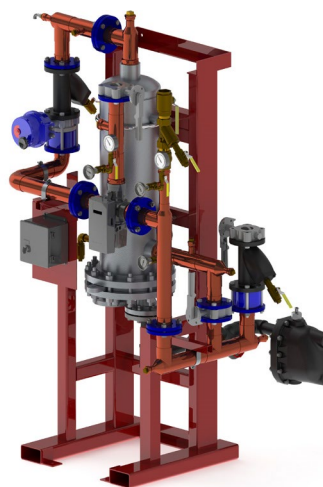
DFS90DW80BS Double Wall