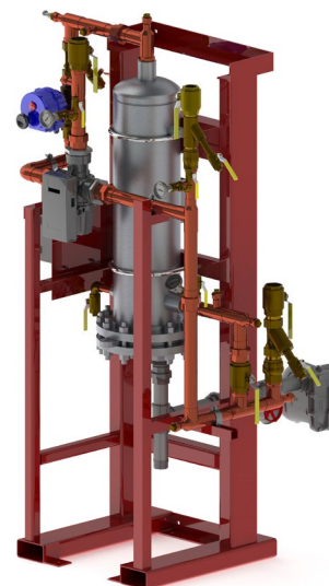
DFS50DW50 Double Wall