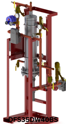
DFS35DW40BS Double Wall