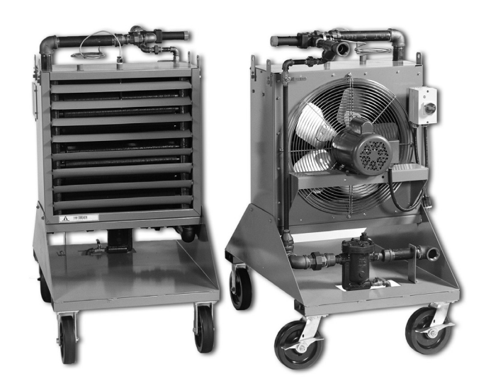
CAQ-202-HS-T12 (380 MBH - 50 psig @ 60°F EAT)

Custom Options are available for Purchased Units to meet specific customer demands.