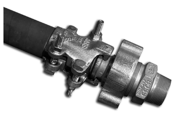
HI-Temp Steam Rated Hose and Quick Connectors