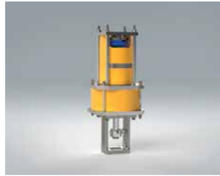
PISTON ACTUATOR LV