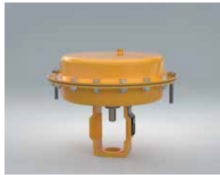
PNEUMATIC ACTUATOR D2